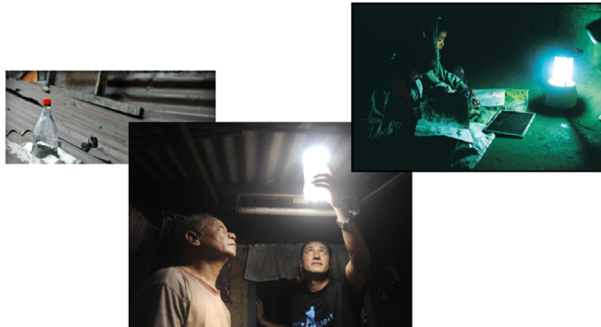
Figure 3. Alternative sources of energy from bio lamps/ LED lamps

lamps' (Fig. 3) are a promising means of supplying a free and eco-friendly source of energy during daylight hours, thereby significantly reducing energy costs and consumption.