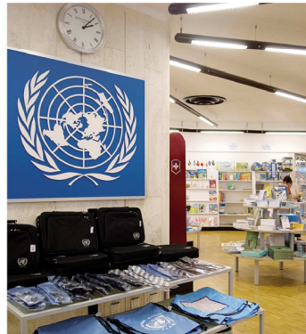
SOUVENIRS / BOOKSHOP Building E - 2 nd Floor