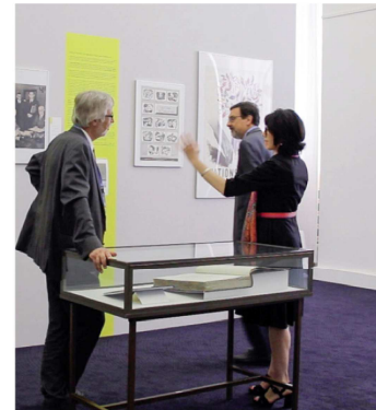
UNITED NATIONS MUSEUM AT GENEVA Building B - 1 st Floor