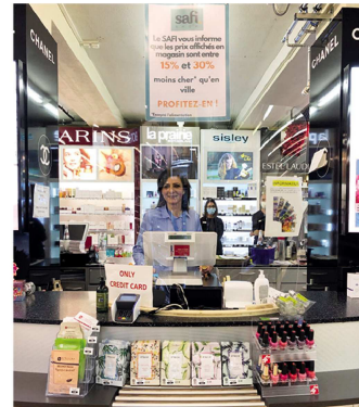
SAFI SHOP Building S - Floor -1

https://www.linkedin.com/company/united-nations-office-at-geneva